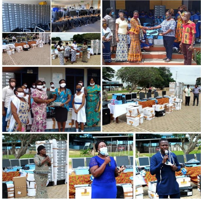
Presentations to various OHP institutions over recent years

The Union of Old St Monicans (UK) is a vibrant community of past students from these seven institutions. Established in 1989, the Union aims to revive friendships, support the institutions, and uphold our motto.