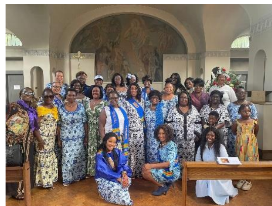
Foundress Service, May 2024